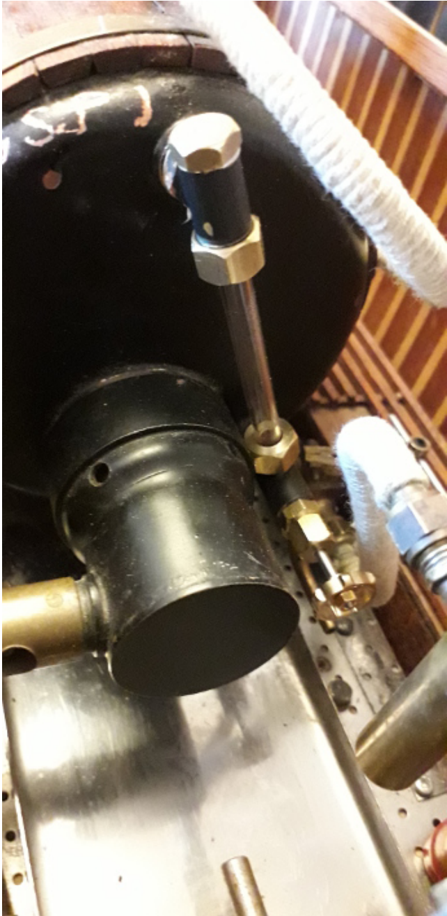
New sight gauge in situ